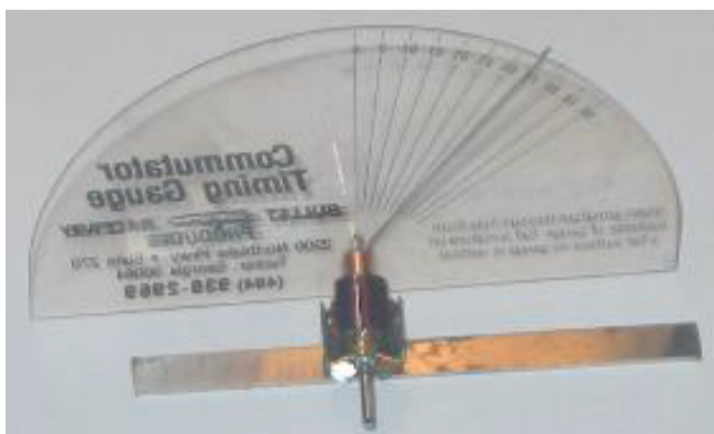
Checking the commutator advance using a timing protractor.

If "economy" has a high priority in your racing, also realise that Higher timed motors are revving faster and hotter which means more bearing wear, hotter magnets that go off quicker, and commutators that wear faster. So now you know - the choice is yours.